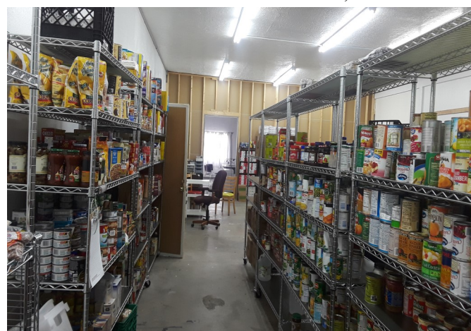
Photo above: While not quite yet complete, here's a first look at the new space we have for food storage, household donations storage and coming in the summer of 2018, the new Healthy Living Center.

As we work towards making our new center a place where people can learn more about nutrition and healthy lifestyles, we encourage our donors who may have any books, cds, and gently used exercise and sports equipment to please consider donating these items to the new center.