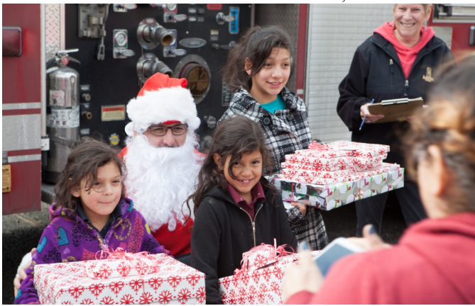
Photo above: Enjoying some "Santa Time" with their friends and neighbors is always the highlight of the Children's Holiday Gift Program as can be seen by the smiles of everyone in this picture.

Photo below: Firemen (aka Santa's Elves) getting Christmas gifts ready to be handed out to the children.