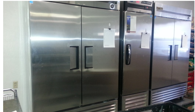
Photo above: commercial freezers in the box prep area. Photo right: The new food storage area. Photo below: new stainless steel tables and a fresh coat of paint in our food box prep area.