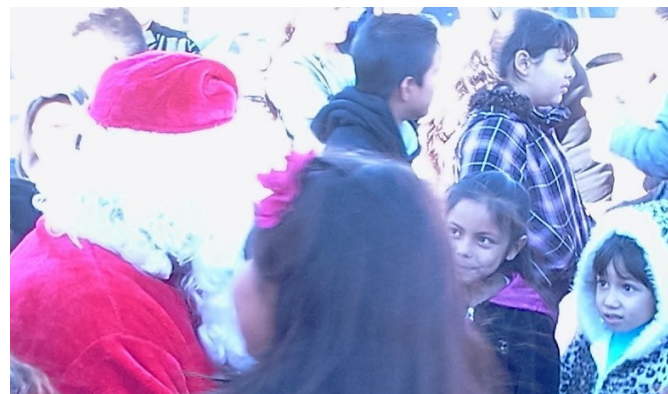
Photo above: Enjoying some "Santa Time" with their friends and neighbors is always the highlight of the Children's Holiday Gift Program as can be seen through the eyes of these two young ladies!

Programs like this are only possible with the generous donations, both in-kind and monetary, that we receive from our amazing donors. Thank you all for helping us succeed yet another year in our goals to end hunger and poverty in our community.