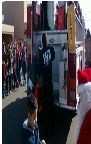
(photo above) Santa arriving at Bienvenidos Outreach courtesy of the Santa Fe Fire Department.

Programs like this one are only possible with the generous donations, both in-kind and monetary, that our amazing donors send to us. As we've said before, we couldn't do it without you!